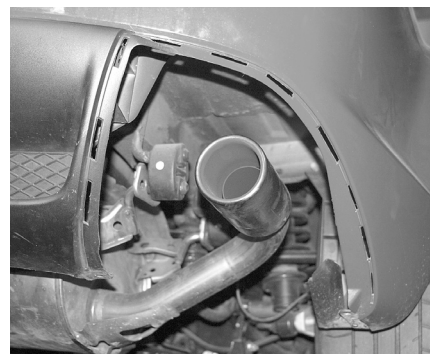
Opening showing tab positions. Take care not to damage tabs during removal!

B. Remove the two nuts (17mm head) that retain the stock exhaust to the catalytic converter section. Retain the springs and nuts for later use. To ease removal of the muffler and connecting pipe, spray the exhaust system hangers at the point at which they extend into the rubber hangers with a spray lubricant. (i.e. silicone spray, WD40, etc..) There are four (4) rubber hangers on the muffler, and one (1) on the connecting pipe.